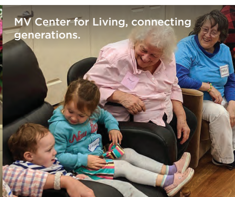
MV Center for Living, connecting generations.