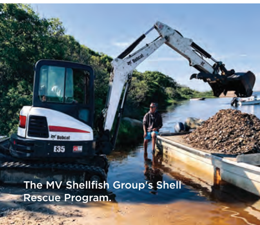
The MV Shellfish Group's Shell Rescue Program.

In May of 2019 IHT purchased the Clark House bed and breakfast and construction began in November 2019 to repurpose the building into seven permanently affordable rental apartments.