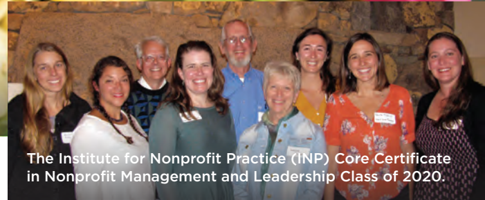
The Institute for Nonprofit Practice (INP) Core Certificate in Nonprofit Management and Leadership Class of 2020.

MV Food Equity Network, a coalition of more than 20 community groups including nonprofits, faith communities, social service agencies, and educators, work together to provide equitable food access and opportunity across the Island.